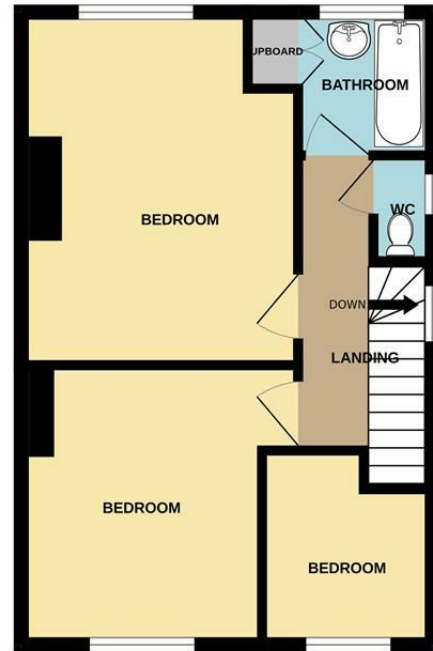
1ST FLOOR 387 sq.ft. (35.9 sq.m.) approx.